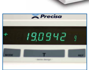
Vacuum Fluorescent Display

Designed, temperature compensated and inspected in Switzerland, these rugged series are built to withstand the rigors of tough industrial conditions. These versatile machines deliver results – simply.