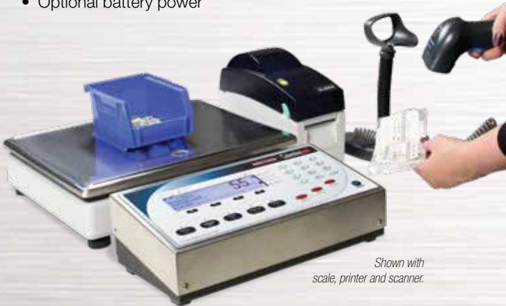
Shown with scale, printer and scanner.