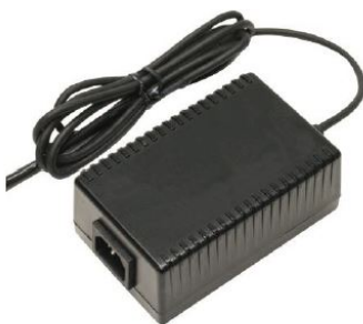
Figure 1. IS6V2 Battery Charger

Connections to the battery pack must be made in the non-hazardous area before connecting the cable to the 882IS indicator.