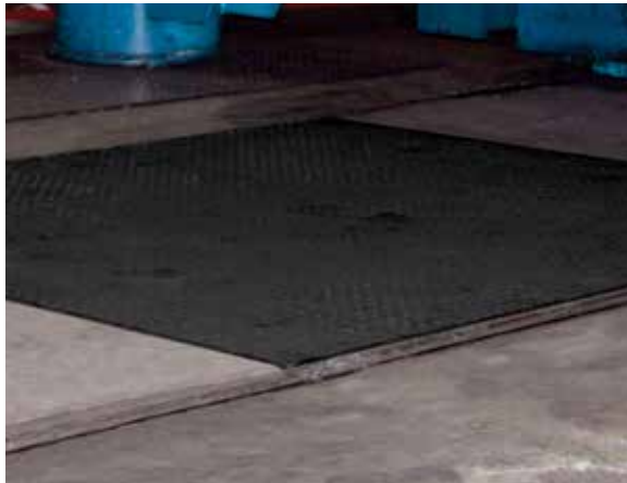
Pit mount installation