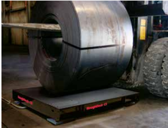
Above ground installation

Get the most from your RoughDeck CS Coil Scale with options and accessories like indicators and remote displays. Or customize your scale with coil cradles and v-tops to optimize your handling needs. The RoughDeck CS can be built to fit existing pit frames, or used in above ground applications.