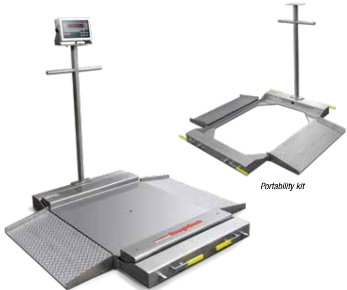
Scale shown with optional portability kit